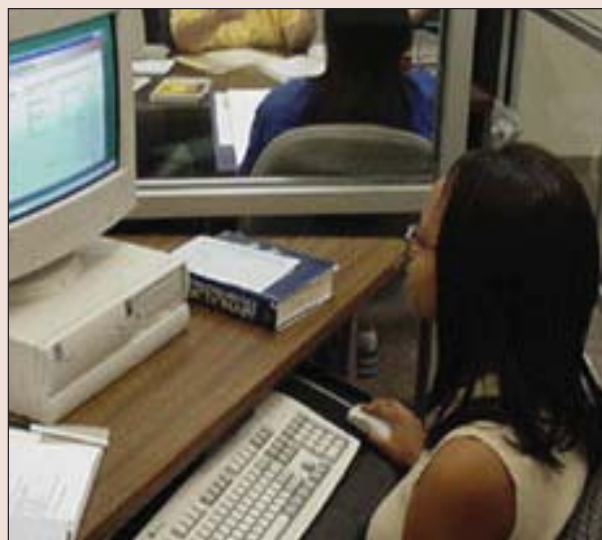
The UAB English Resource Center is the place to go for free advice from tutors on your papers, proposals, applications or reports. Find out more on page 7.

The GRADUATE STUDENT NEWSLETTER is published in electronic format every two months and distributed to all 5,000+ UAB graduate students via email. Articles submitted by UAB graduate students will be given priority for publication, however UAB faculty and staff are also welcome to write. The submission deadlines are on the 30th of July, September, November, January, March, and May. To submit an article, e-mail gsn.editor@gmail.com .