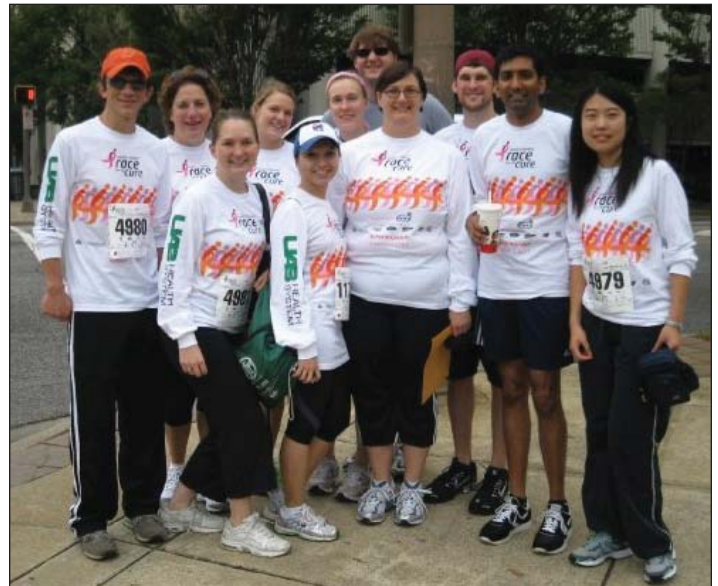
Graduate Students in the Pathology Department were among those who formed teams to raise money and participate in the Susan G. Komen Race for the Cure.

as well as choose from a variety of other 'races' for different charities/organizations available, because, as the current/future generation, we have a strong influence on the direction that research is heading. In a sense, we are protecting our loved ones and our own future health. During the race, we were able to interact with a few survivors and it really meant a lot to them."